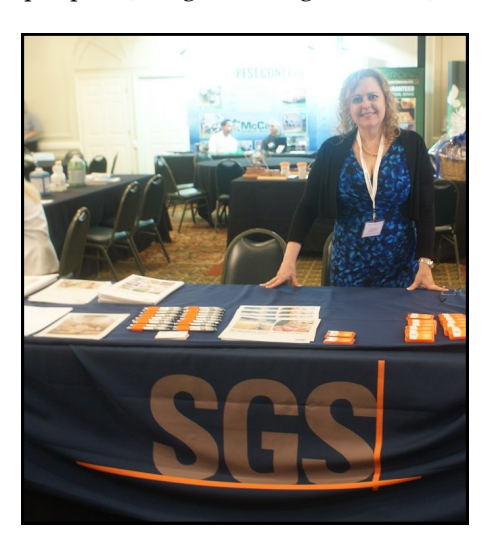
Eighteen FAFP sponsors provided food safety information to attendees at the Affiliate's 2016 Annual Education Conference, held May 11–13 in Crystal River.

Our valued sponsors provided 18 well-appointed exhibitor booths to display informative literature on food protection, products and services. FAFP once again enhanced the exhibitor experience by continuing our Exhibitor Challenge, where attendees received stamps for their 'passport' (designed as a golf course)